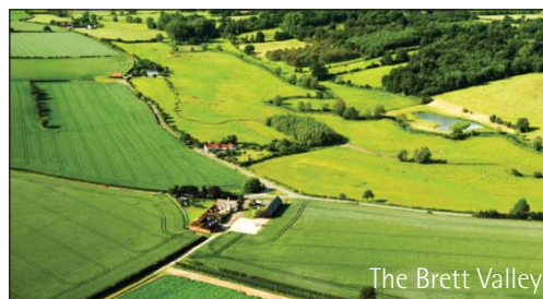
The Brett Valley

As you look over the Brett Valley you can see an area of meres or fleets. These are low lying pieces of inland water near rivers that may have been formed