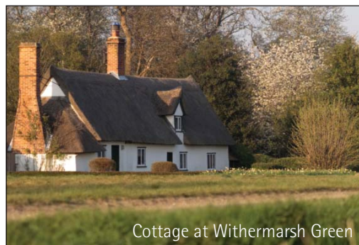
Cottage at Withermarsh Green

The main street would once have seen flocks of thousands of geese and turkeys from Norwich and Ipswich on their way to London markets in an early 1800s autumn. To protect their feet for the long walk they were walked through hot pitch and sand to make durable 'slippers'!